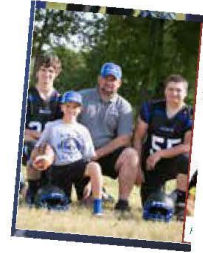
Quarter Page Player Ad (Business Card ad will be half of the qtr page ad)

Add a personal note or quote to your ad: