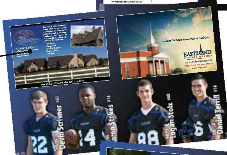
Half Page Player Ad