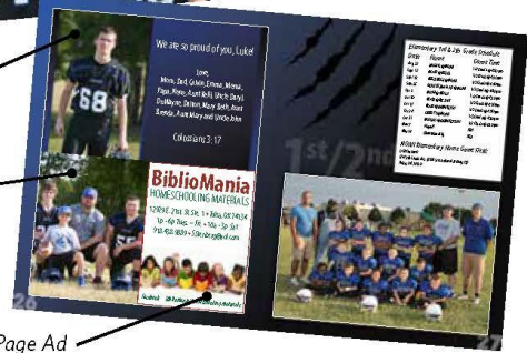
Quarter Page Ad